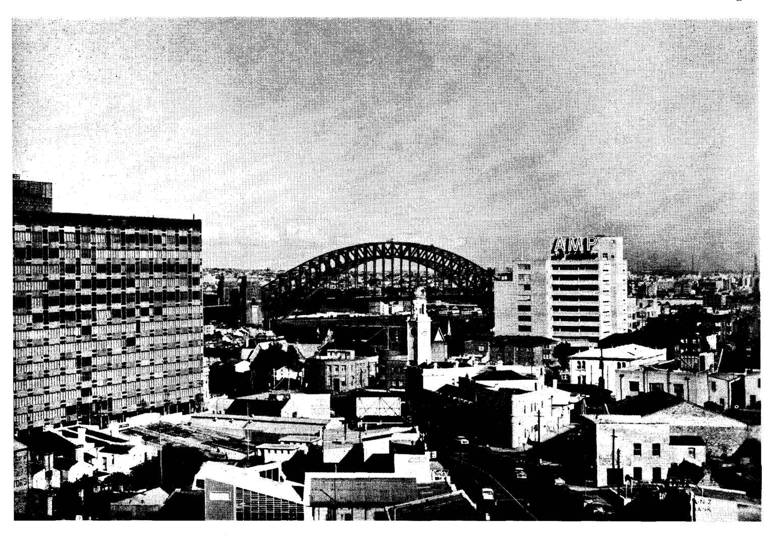
The ultra-modern "MLC" building, left, with famous old Sydney bridge in the background. Directly across the street from the building in which our new offices are located, and in the right center of the picture, is the small branch bank. Facing it, though not visible, is the North Sydney Post Office. The Radio Church of God offices in the "MLC" building look out over the sweeping expanse of beautiful Sydney Bay, and are located on the opposite side of the building.

ily after family. Eating was a delight this day for with each bite came a fellowship long to be remembered. Love and unity was strong and each enjoyed one another's conversation and presence. Seated on the grass, everyone was able to relax and just fellowship one with another and learn more about the bond between those jointly striving to enter into the kingdom of God.